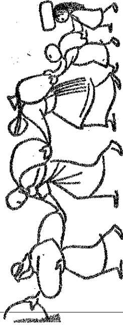
Do good to everyone.

Solemnity of the Holy Trinity June 6, 1982